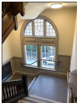
Roudenbush Community Center Westford, Massachusetts

The Roudenbush Community Center was built as the Second Westford Academy Building in 1897. After serving various educational and recreational uses over time, it became a community center in 1975. Years of deferred maintenance and deterioration of an extensive fire escape triggered needed improvements for current and future generations.